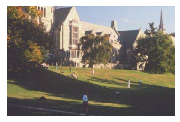
One of the many beautiful views of Haverford's campus (left) and Bryn Mawr's campus (above).