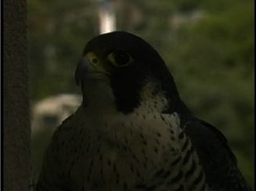
Peregrine falcon nesting on the 40<sup>th</sup> floor of the Cathedral of Learning